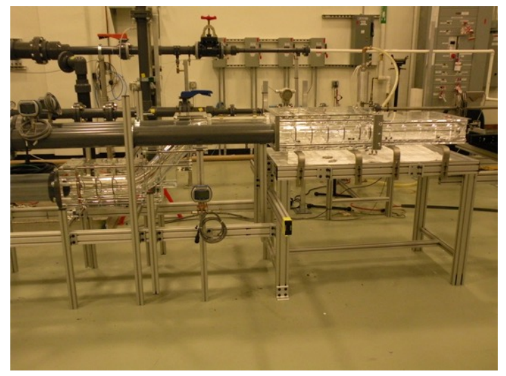
Acrylic SNS Jet Flow Target installed in Water Loop