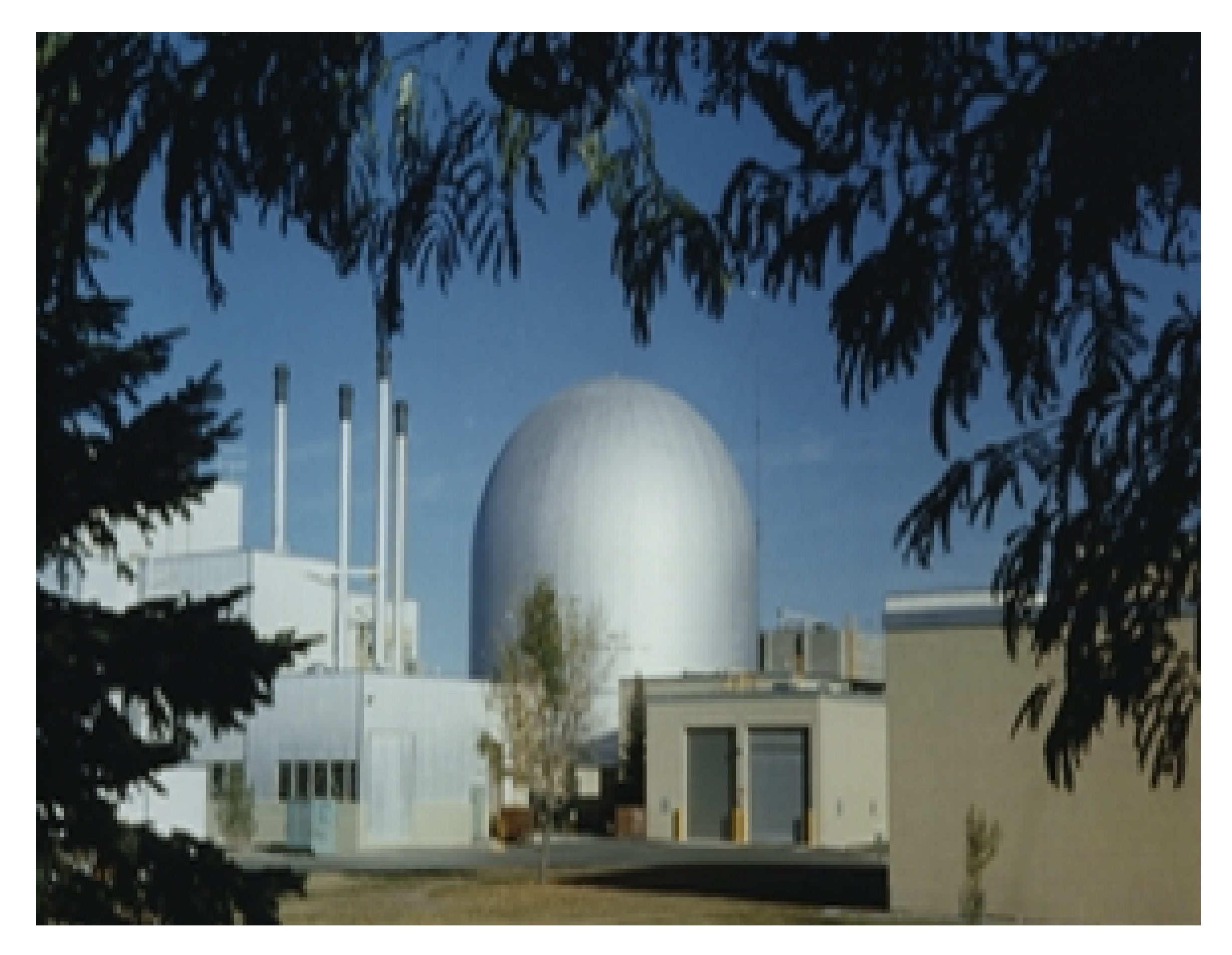
(Image 1): Experimental Breeder Reactor-II (EBR II) at the National Reactor Testing Station in Idaho.

By deploying FRs in an energy mix, power producers are able to provide reliable electricity to customers while integrating with other generation technologies, such as variable renewable energy resources. Flexible load following capabilities allow a reactor to adjust to demand and intermittent supply. In times when less power is needed, fast reactors have a ramp-down rate of less than 15 minutes. When the demand for energy increases, it can be ramped up to full power within minutes.