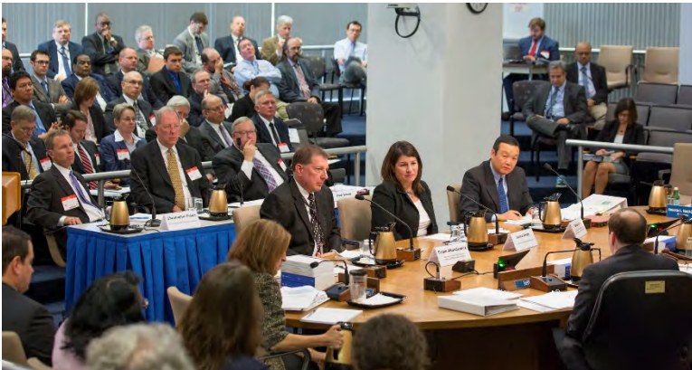
Mandatory hearing conducted by the Commission

The NRC documents its findings on site safety characteristics and emergency planning in a Safety Evaluation Report and on environmental protection issues in Draft and Final Environmental Impact Statements.