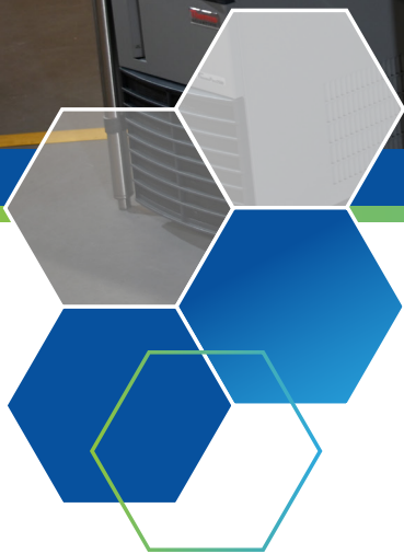
SPHERE test bed and seven-hole test article