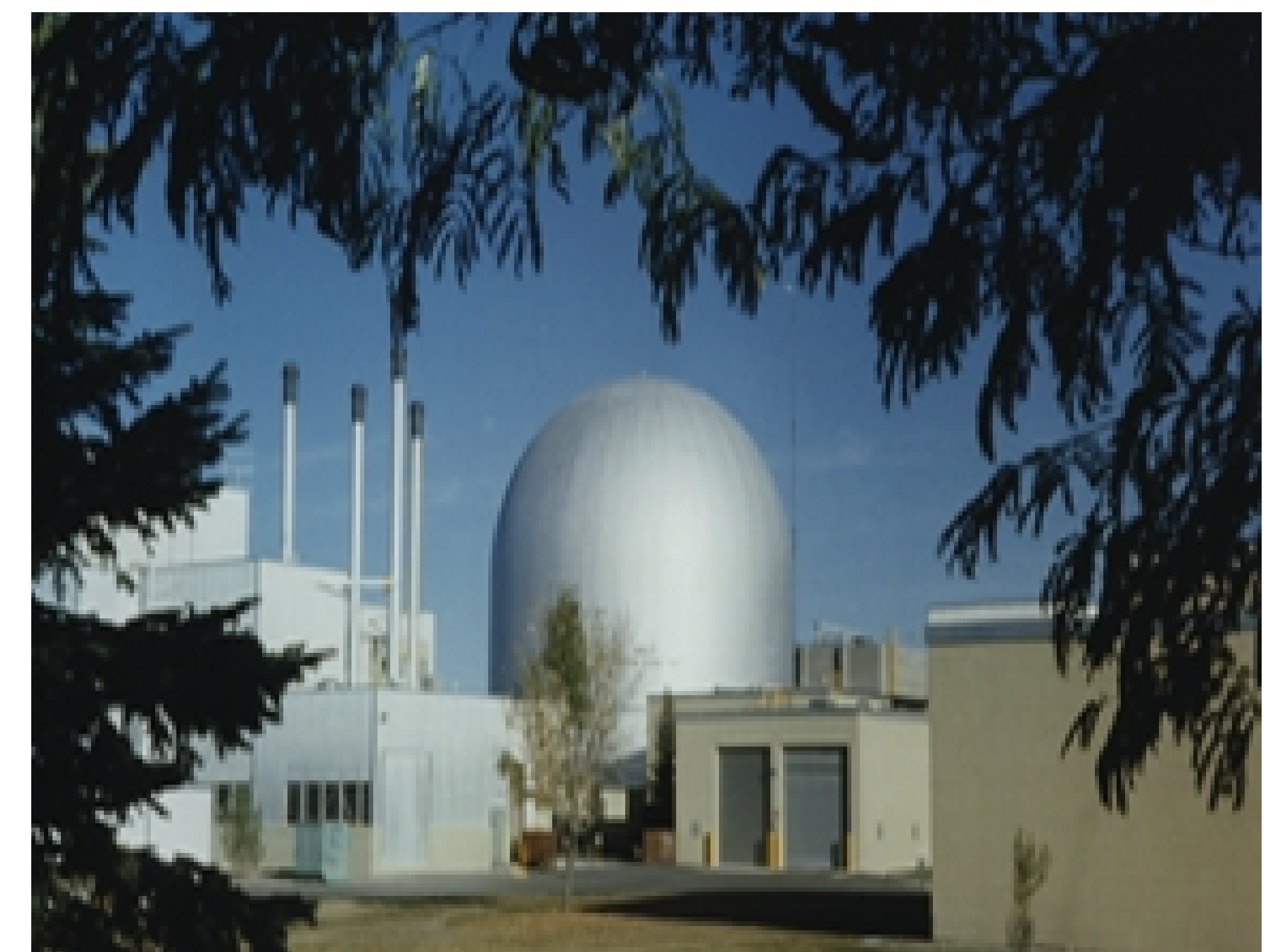
(Image 1): Experimental Breeder Reactor-II (EBR II) at the National Reactor Testing Station in Idaho.

The unique properties of FRs enable efficient fuel utilization and waste minimization. FRs can operate with a favorable neutron balance; fission reactions in FRs are capable of creating more neutrons than consumed. By converting these excess neutrons into usable fuel materials, some FRs are designed to produce more fuel. FRs are also flexible to accept a wide range of fuel materials, with many designs capable of recycling existing nuclear waste in a closed fuel cycle. The efficient fuel utilization of FRs can also enable some designs to operate for decades without refueling. FRs offer fuel cycle flexibility, providing a robust fuel supply and improved nuclear waste management.