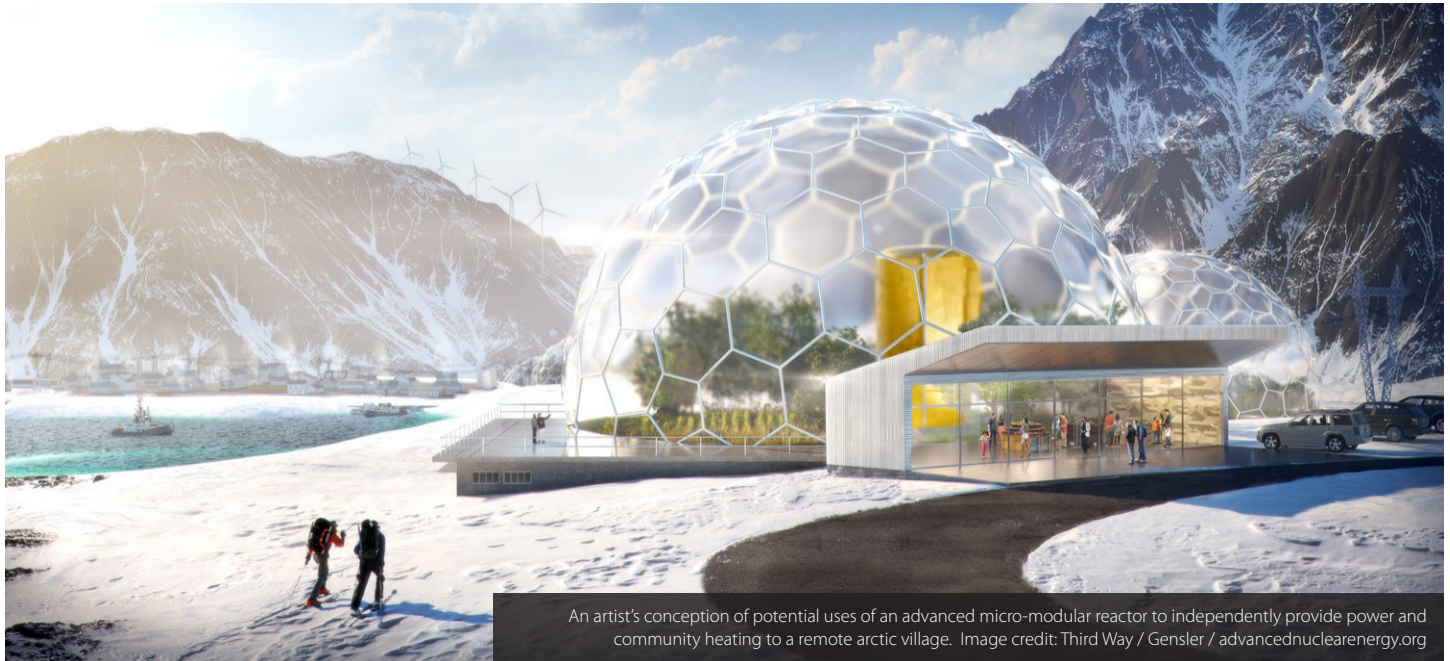
An artist's conception of potential uses of an advanced micro-modular reactor to independently provide power and community heating to a remote arctic village.