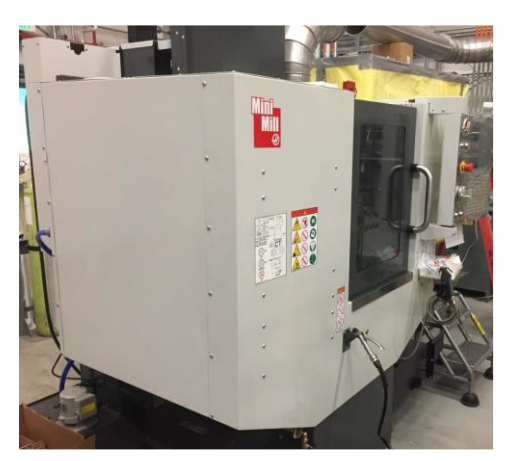
New milling machine in EFF

The ability to produce and perform research on ceramic fuels is being expanded to include uranium oxide (the commercial power industry standard), as well as nitrides, silicides, and other compound fuels that are being investigated as next generation fuels. To support this effort, two new items will be purchased, (1) a 9-in. hearth tri-arc arc melter that will allow for larger scale alloy production, and (2) a high-temperature sintering furnace accessible from an inert glovebox to provide a larger and better platform to process ceramic fuels.